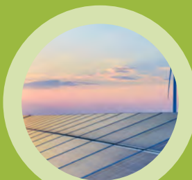
TRI 2: Enhanced zero emission Power Technologies