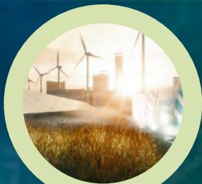
TRI 5: Integrated Regional Energy Systems