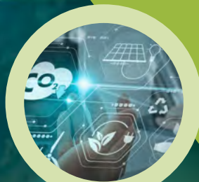
TRI 6: Integrated Industrial Energy Systems