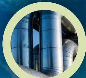
TRI 4: Efficient zero emission Heating and Cooling Solutions