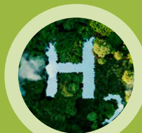
TRI 3: Enabling Climate Neutrality with Storage Technologies, Renewable Fuels and CCU/CCS