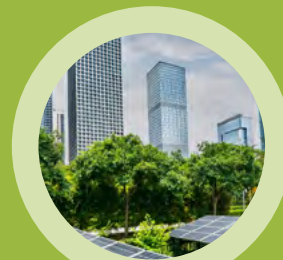
TRI 7: Integration in the Built Environment