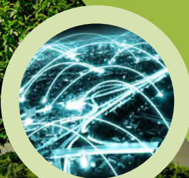
TRI 1: Integrated Net-zero-emissions Energy System

Implementing accompanying activities on knowledge management and maximising impact